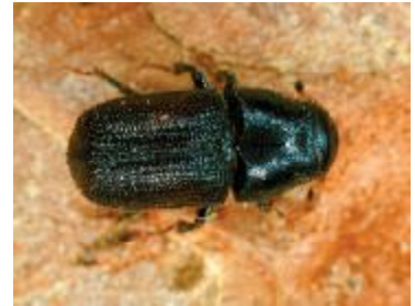
Figure 3: Top view of adult MPB (actual size, 1/8 to 1/3 inch).

Mountain pine beetle has a one-year life cycle in Colorado. In late summer, adults leave the dead, yellow- to red-needled trees in which they developed. In general, females seek out large diameter, living, green trees that they attack by tunneling under the bark. However, under epidemic or outbreak conditions, small diameter trees may also be infested. Coordinated mass attacks by many beetles are common. If successful, each beetle pair mates, forms a vertical tunnel (egg gallery) under the bark and produces about 75 eggs. Following egg hatch, larvae (grubs) tunnel away from the egg gallery, producing a characteristic feeding pattern.