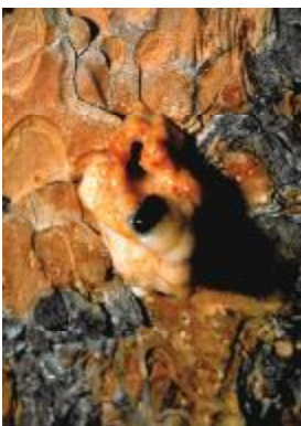
Figure 6: Not all pitch tubes indicate successful attacks. Note the beetle trapped in this large pitch tube. If the majority of tubes look like this, the tree may have survived the current year's attack.