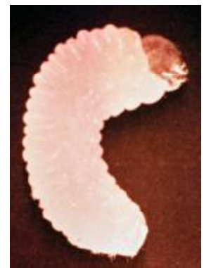
Figure 5: Larva of MPB (actual size, 1/8 to 1/4 inch). They are found under the bark in tunnels.