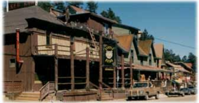
right: the Little Bear Saloon today

Legend says the most lucrative point-of-sale for bootleggers during Prohibition (1919-33) was behind the Little Bear when it was Prince McCracken's Drugstore and the Round Up Dance Hall and later the Red Ram. Some of the original church structure is said to remain at the rear of the Little Bear building.