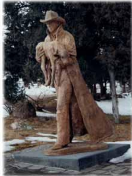
"The Foreman" sculpture at the Hiwan Homestead Museum

This community service tradition has guided the transformation from a remote glamorous hideaway to today's funky Main Street of an upscale residential area. Most locals are satisfied with Colorado Special Districts, Denver Mountain Parks, JeffCo Open Space and other Jefferson County services for basic "government." They would rather depend on volunteer neighbors than pay higher taxes for more layers of potentially unresponsive government. The Evergreen Area Chamber of Commerce campaign captures the community spirit: "Everything's in Evergreen."