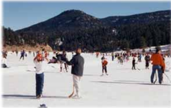
left: Ice Skating on frozen Evergreen Lake

The 3-story, Showbarn Plaza building was constructed in 1972. Different restaurants have always occupied the main floor, from "My Friends" to today's Rib Crib Sports Lounge owned by Evergreen native Troy Tyus. The bar seats 55 and non-smoking dining room seats 60.